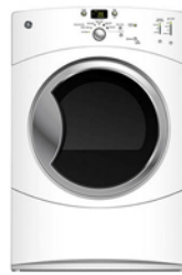
Dryer Color: White (Electric)