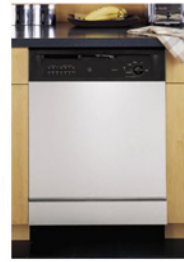
Dishwasher Color: Stainless Steel