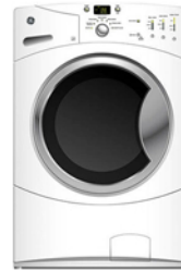
Washer Color: White