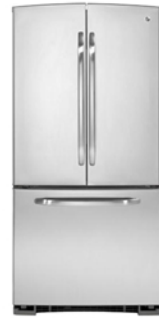
Refrigerator (22 cu. ft.) Color: Stainless Steel