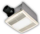
Bathroom Fan/Light Combo Color: White