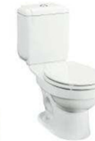
Toilet Color: White