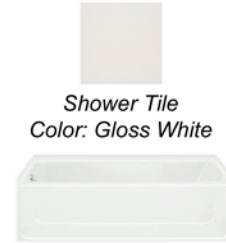
Shower Tile Color: Gloss White Tub/Shower Color: White