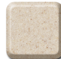
Livingstone Bathroom Countertops Color: Key West