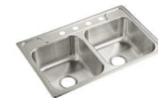
Kitchen Sink Color: Stainless Steel