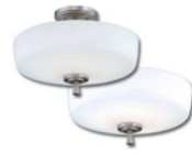
Entry/Hall Color: Polished Brushed Nickel