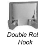
Double Robe Hook