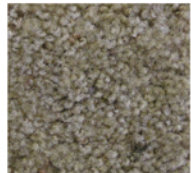
Carpet @ Living/Bedrooms Color: Toast