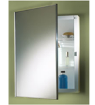
Recessed Molded Cabinet