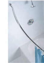
Curved Shower Rod