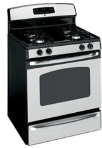
Range Color: Stainless Steel (Gas)