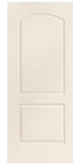
Entry Door Interior Color: Brilliant White Exterior Color Varies