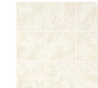
Vinyl @ Laundry Closets Color: Biscuit