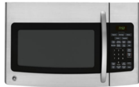
Microwave Hood Color: Stainless Steel