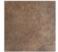
Tile @ Entry/Bathrooms Color: Chianti